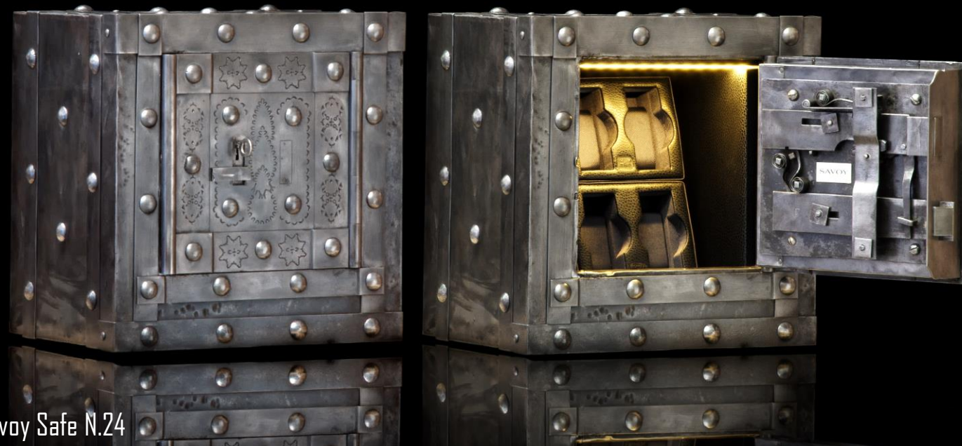
Savoy Safe N.24

Tradizione artigiana italiana SAVOY CASSEFORTI SENZA TEMPO