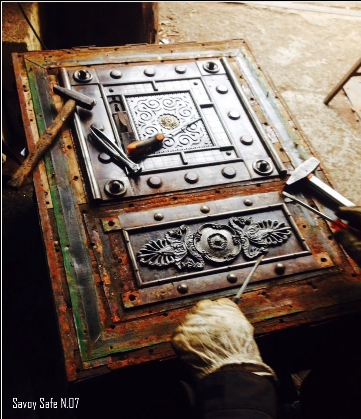
Savoy Safe N.07