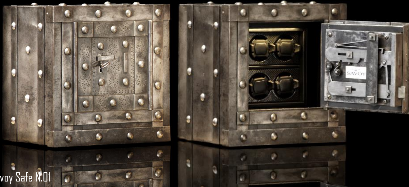
Savoy Safe N.01