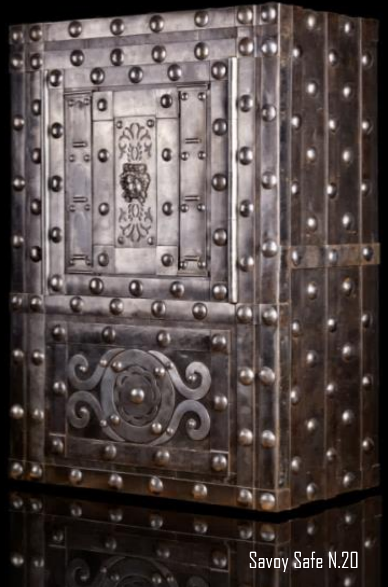
Savoy Safe N.20