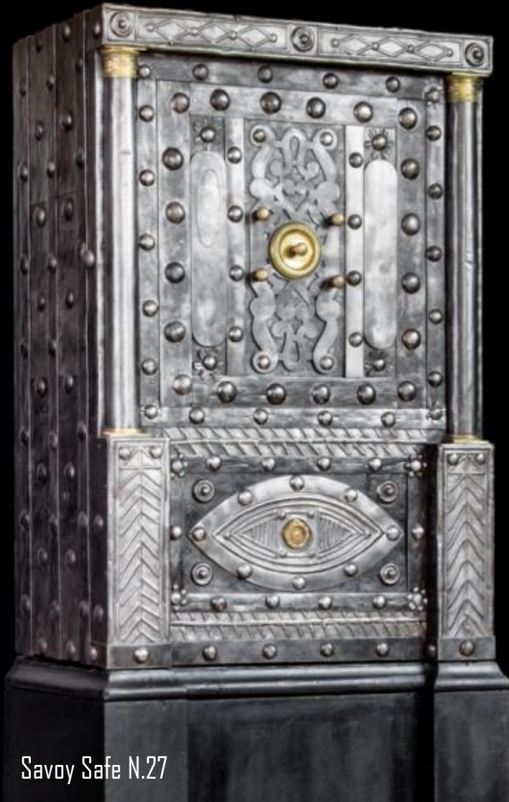
Savoy Safe N.27